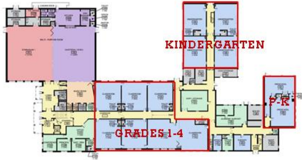
Existing Ground and First Floor Plan