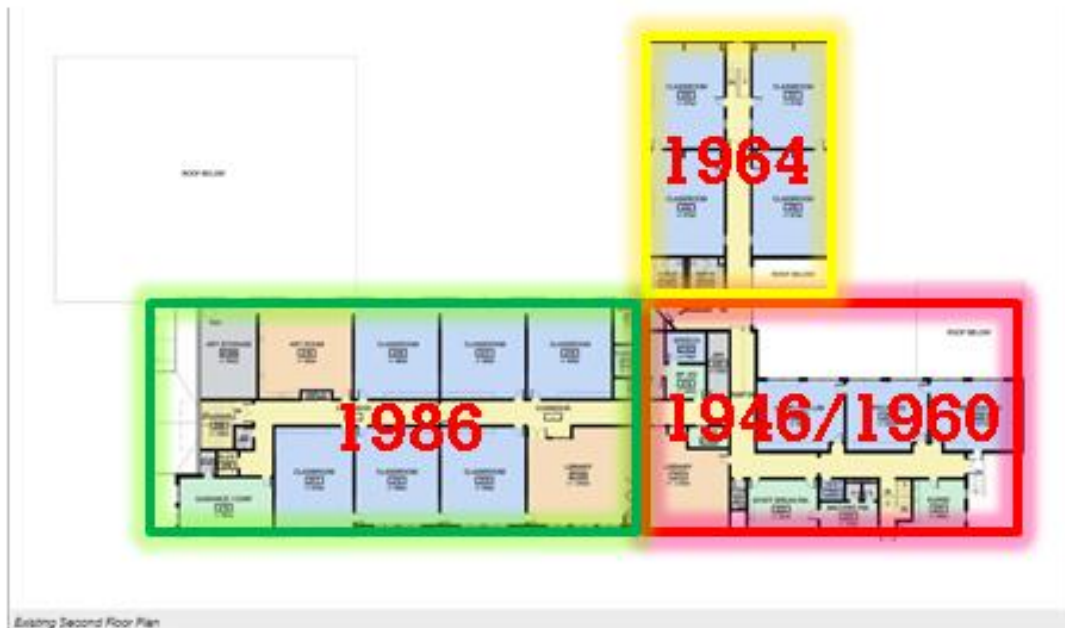
Existing Second Floor Plan