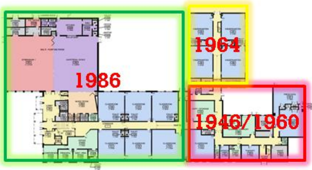
Existing Ground and First Floor Plan